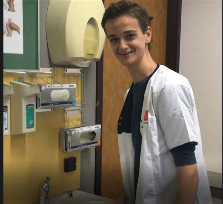
2017, 1st year student